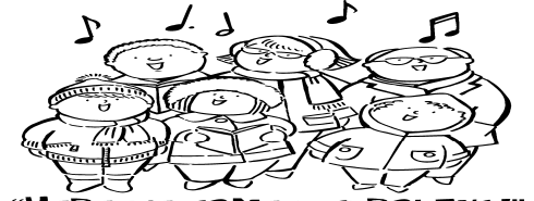
“HERE WE COME A-CAROLING!”

We will meet at the church at 2:30 p.m. to split into teams to go caroling, and return to the church afterwards for a soup supper. Please bring cookies or a dessert to share. Soup, sandwiches, and beverages will be provided. ...Congregational Outreach Team & The Seekers Group